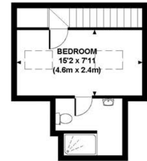
FOURTH FLOOR GROSS INTERNAL FLOOR AREA 213 SQ FT